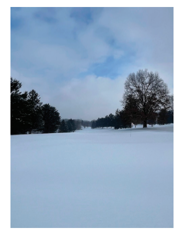
Bridgeport Country Club

2025 Membership Dues Invoices will be EMAILED this year! Invoices will be sent out the last week of January. If I do not have your email address on file, you will receive a paper invoice in the mail. Please update your contact information by emailing me at 1971wvgcsa@gmail.com.