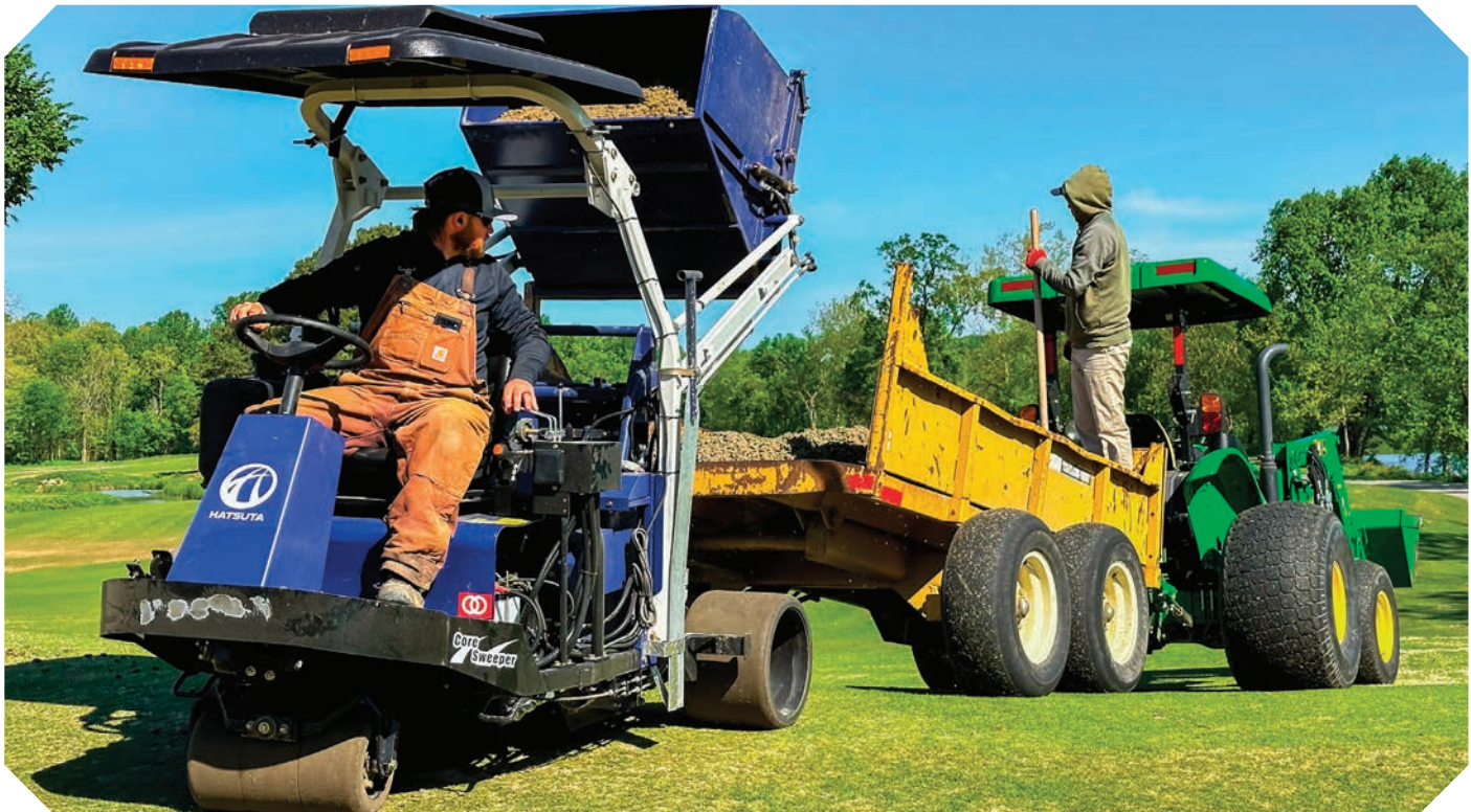
A new core sweeper makes aeration cleanup a much less painful task.

Brian Gietka, agronomist – bgietka@usga.org