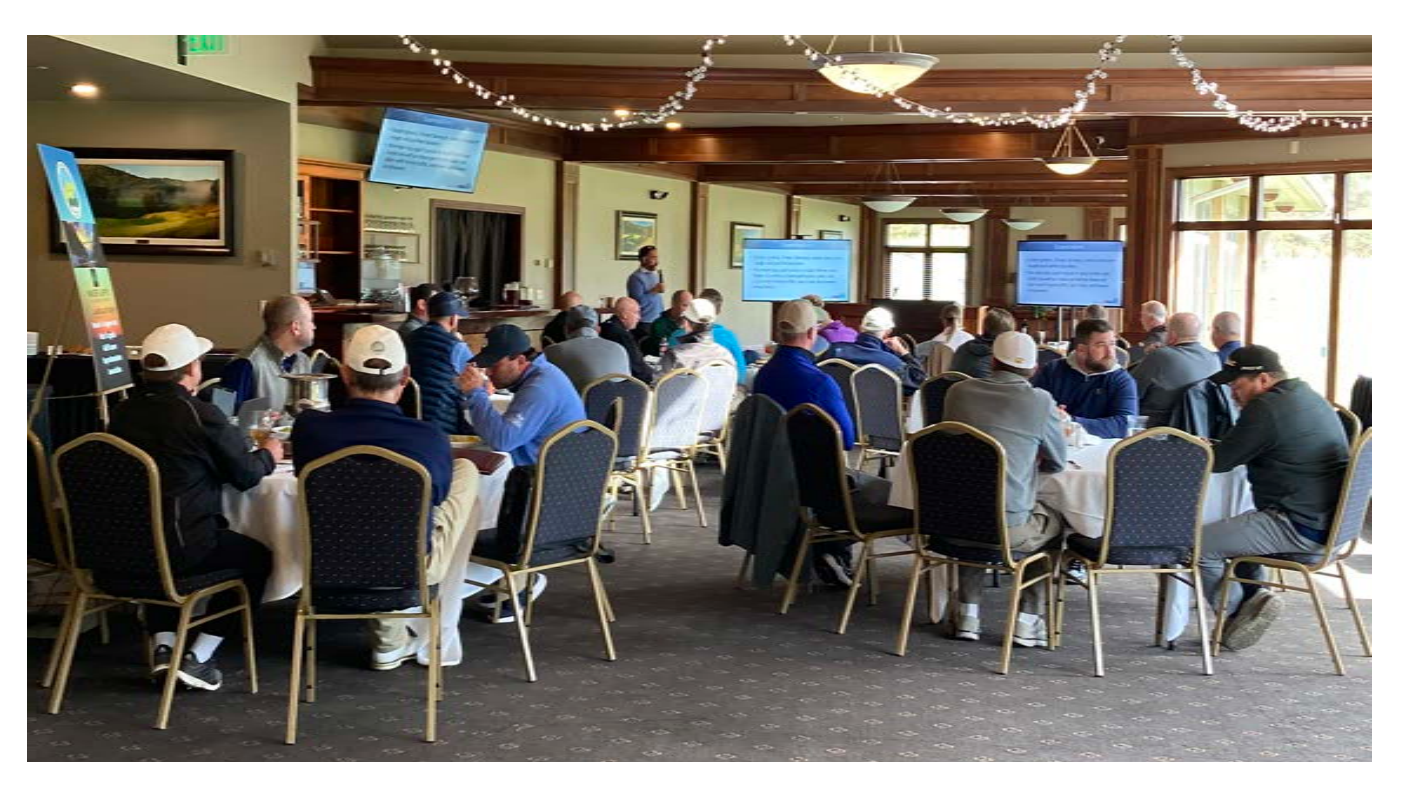
USGA Education Seminar @ Pete Dye Golf Club